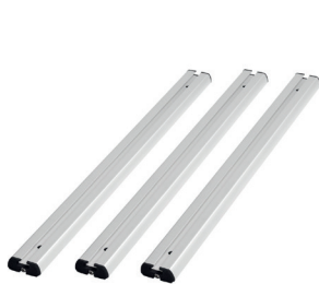
Thule VeloSlide Mounting Rails 70 cm (1 set = 3 pieces)