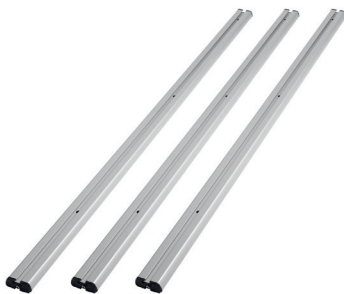
Thule VeloSlide Mounting Rails 140 cm (1 set = 3 pieces)